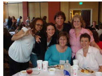
Great presenters and dinner from Paula Deen's Lady & Sons restaurant meant full minds and full bellies!