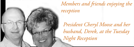
Members and friends enjoying the reception